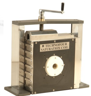
Magnetic Saturation Coil

NDT House, 45, Dr Ambedkar Rd, Pune 411001, INDIA Tel: +91 20 2605 8060 Fax: +91 20 2605 8070 Info@technofour.com www.technofour.com